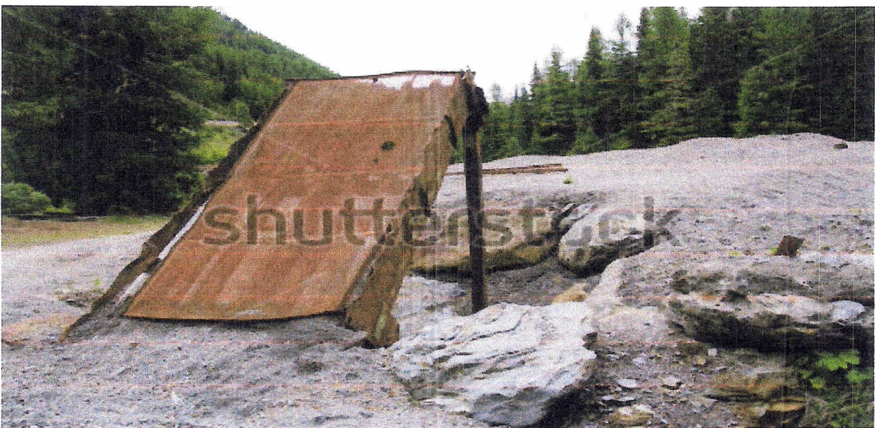
Filtering using the steel matting screen