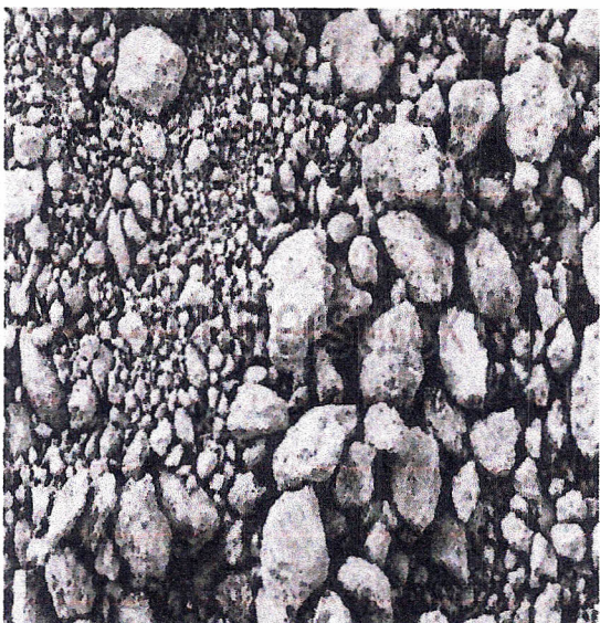
Sand and Gravel Aggregate