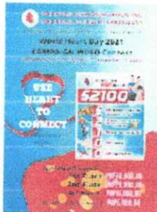
WHD 2021 Video Contest Poster.jpg 233K